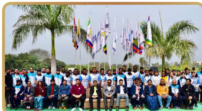
SMPL Super Spinners