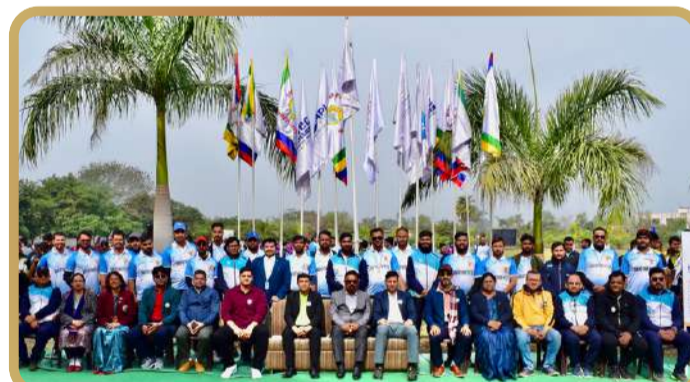
SNPL Rice Steamers