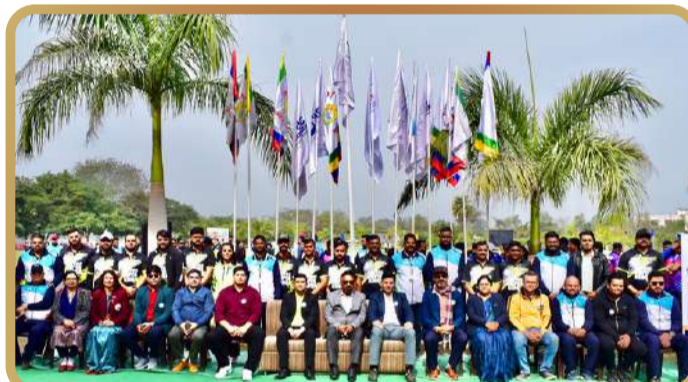
SISTec Super Kings