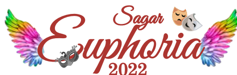
Annual Techno-Cultural Fest